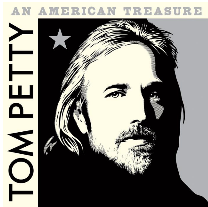
Album artwork by Shepard Fairey

Starting today, Tom Petty fans are invited to share their favorite moments of Tom and The Heartbreakers from their personal archives to create a brand new official music video for one of the next songs to be released from the upcoming career-spanning box set An American Treasure . Submissions can include a picture taken with Tom, a favorite video moment from a show or any expression of love for the band that they've photographed and cherished throughout the years. Tom often said, "Without you, there would be no us" and this video is a way to honor