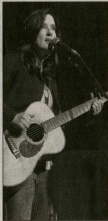
BRANDY CLARK adds a soft-rock touch.

Today many of his former peers have retired from the road, as George Strait did last year, or ventured outside the country mainstream, as Garth Brooks did in November with his pointedly titled comeback album, "Man Against Machine."